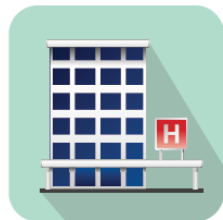
In February, she has health expenses of $1000