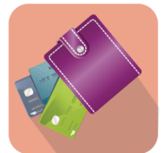
In March she has billed health expenses of $170. She pays $170

Then, for the next 6 months she has no health expenses and pays nothing.