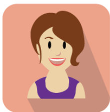
Mary's Share of Cost (SOC) is $980

Don't worry – a share of cost is not an amount you must pay. Rather, a share of cost is like a monthly deductible. That is, if you have unpaid medical expenses in a month, Medi-Cal will only pay the amount that exceeds the share of cost. Then, Medi-Cal will pay for all remaining Medi-Cal covered services that month. Here is an example: